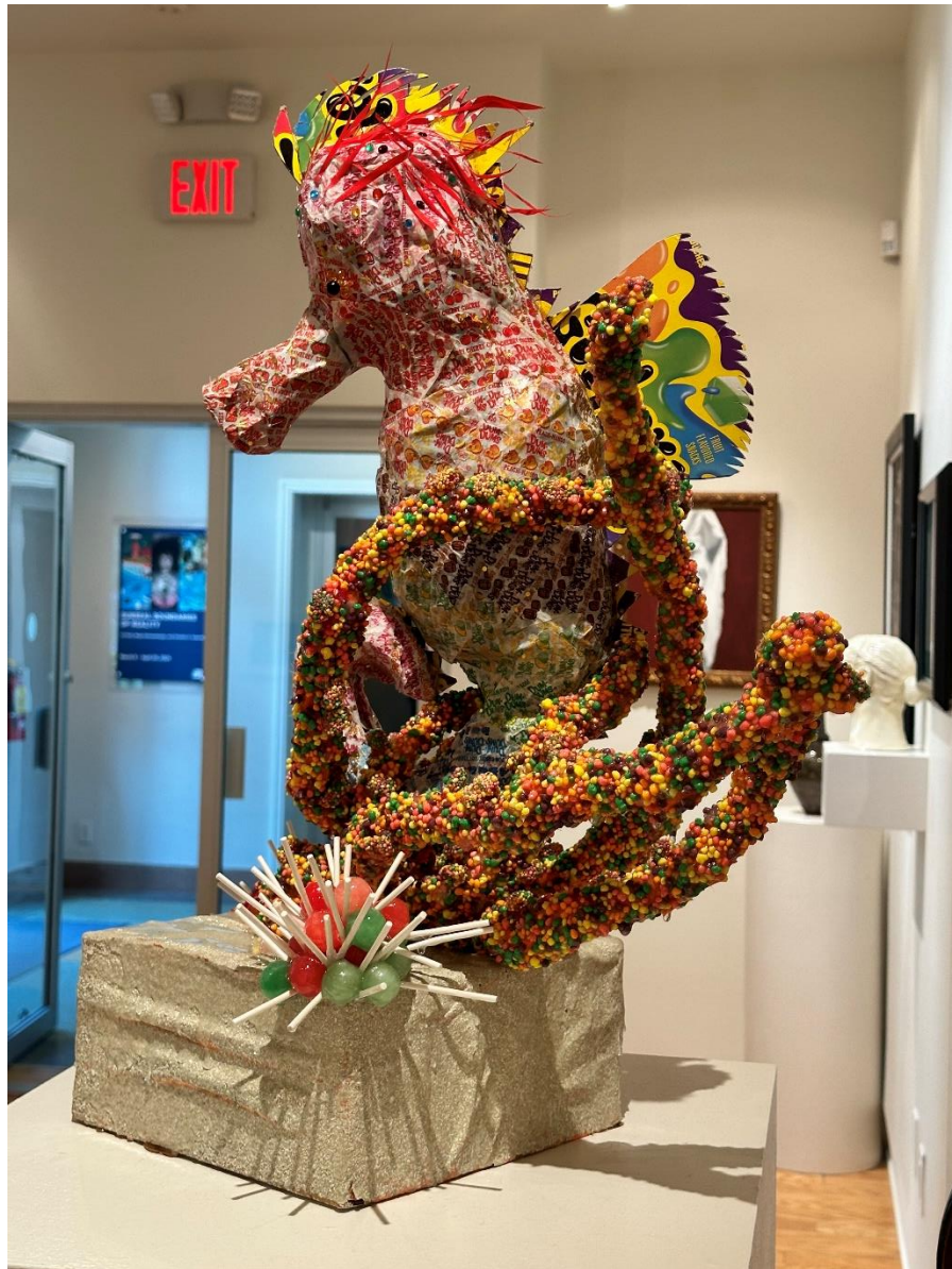
Lexie Cugini Sweet Seahorse Sculpture $250

I am an ocean girl! I love the creatures that live in our fragile waterways. Sweet Seahorse was inspired by all of the challenges that seahorses overcome to live. When I think of seahorses, I think of elegant, majestic and delicate creatures just hanging on to our ever increasing polluted waters. They are killed by fishermen nets, coastal development and pollution. I wanted to capture the sweet beauty of a seahorse; hence the candy wrappers, candy and seahorse. Seahorses are oftentimes overlooked and forgotten. We need to protect our fragile waterways and the sweet creatures that inhabit them!