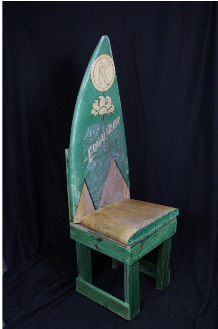
Rush McIlvaine Surfboard Chair Sculpture NFS

It's more than just a chair! My love for the beach and for surfing served as inspiration for the design and construction of this surfboard chair. Blending these two passions, the excitement of catching a great wave and the comfort of a functional piece of furniture, I envisioned The Equalizer. I used a recycled surfboard as the foundation, found wood for the framing and the earthy colors may remind you of sitting at the beach watching a good set roll in. The chair's design not only looks cool but also offers a comfy seat, shaped to balance the curves of the body. This work of art brings harmony to our monotonous daily life, by emphasizing the beach and ocean's energy through its form. Who wouldn't want to be reminded during their busy schedule of the possibility of an epic day of waves? Throughout this project, my main goal was to bring the beach, its comforts, and my love for the ocean to the audience.