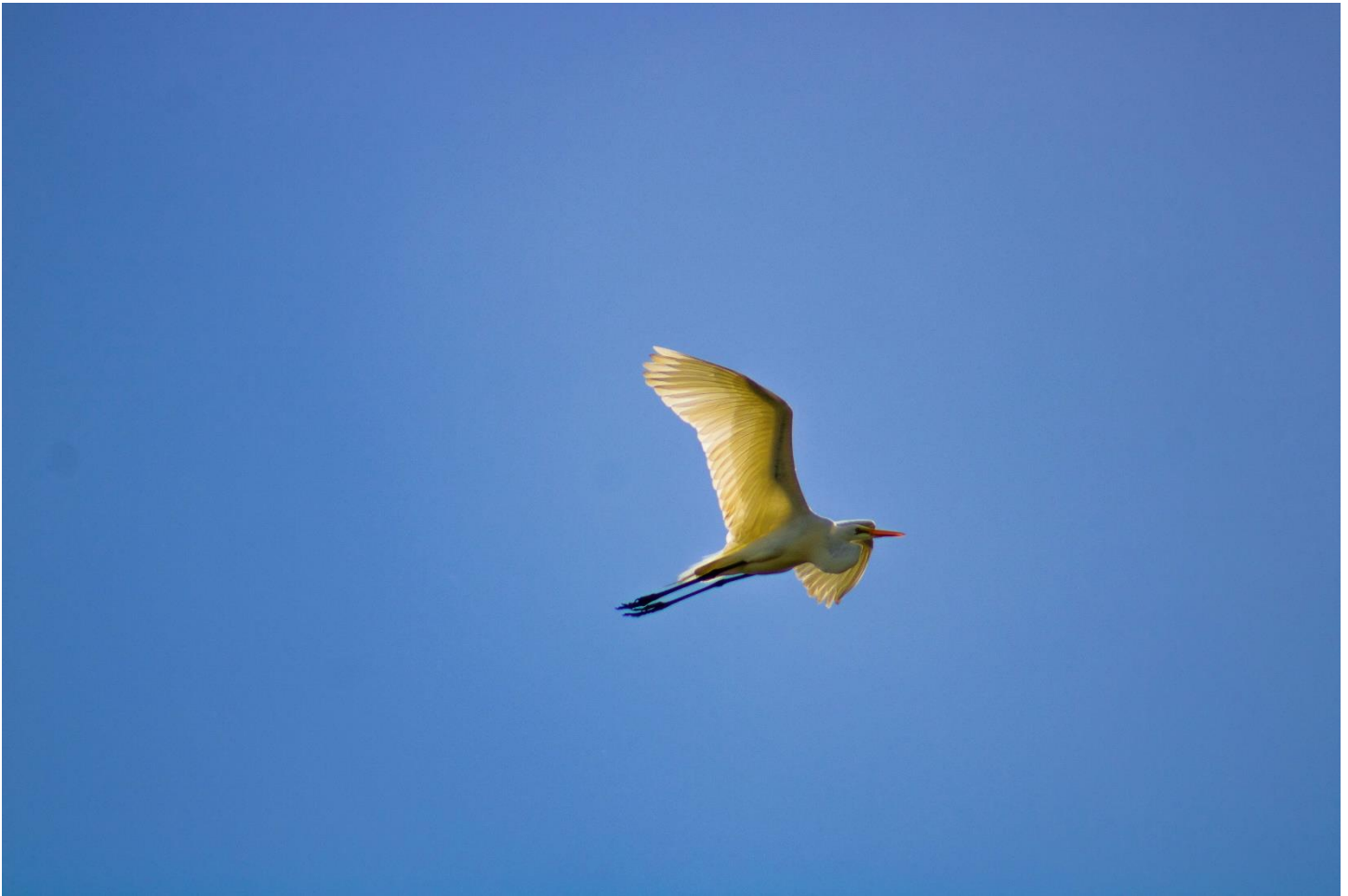
Andrew Galdys Egret Photography $250

I enjoy photography because it gives me the ability to experiment with new ideas in a variety of ways. I chose my AP portfolio theme because of my love for nature. This work is part of a larger AP portfolio that seeks to answer the question; How can I show the unique ecosystem of Florida through aviary photography? With this specific piece, my goal was to capture the beauty of flight. The spread wings symbolize the freedom that comes with mobility. The white color of the bird is a representation of the purity of nature