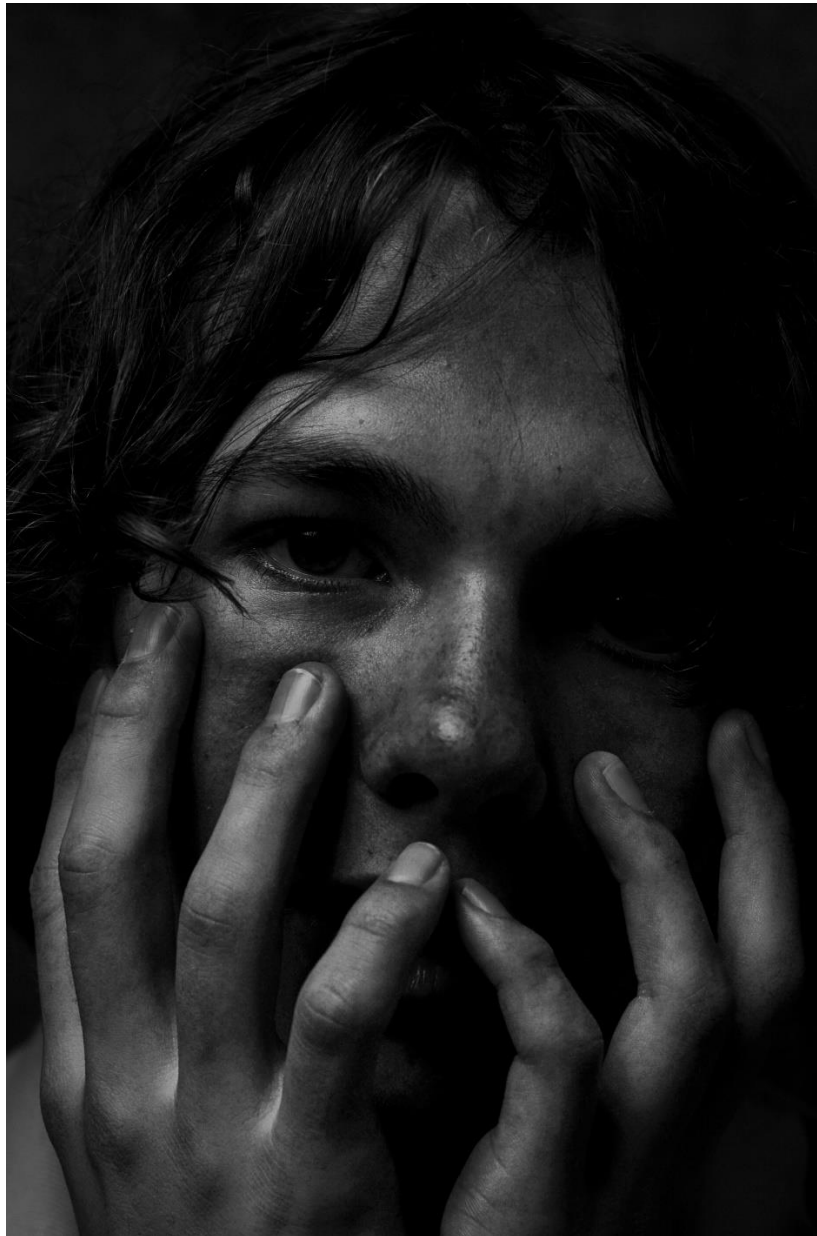
Lucas De Silva Anxiety Photography $250

For me, art and photography has been a way to express feelings and emotions by capturing portraits, much like this piece. "Anxiety" is a part of a greater portfolio that attempts to capture the idea of society and the conformity and pressure it applies to its members. The piece itself aims to show the crumbling of a person, the erosion of a persona caused by a constant pressure from society. I did this by using specific lighting along with lightroom to emphasize certain parts of the photo. I also utilized black and white coloring to show more shadows and light. To complete the photo, the model pulls on his face slightly to show the pressure and crumbling of a person.