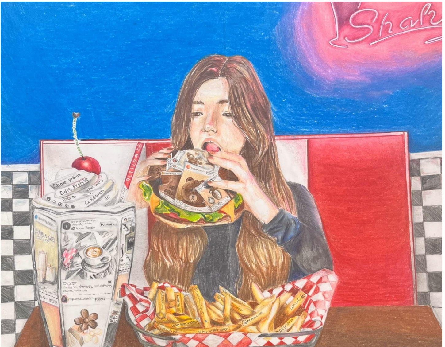
Ella M. Insatiable Drawing NFS

This piece explores the relationship between teenagers and the over-consumption of media. Situated in a diner, the teen is seen eating a variety of overly-sized foods that are created out of social media features. Using colored pencils to properly capture each small feature, I experimented with attempting to make components of the piece, specifically the burger, look as though actual 3-dimensional papers (the posts) had been laid out. As for the posts themselves, they consisted of meaningless content which was on my actual social media feed, paired with a blank expression to touch on the redundant and unnecessary overabundance of content.