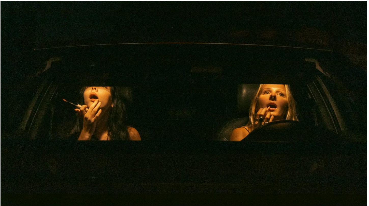
Sydney Launay Sisters Photography $300

This work, Sisters , is meant to represent the relationship between two girls who consider each other best friends. I created this piece to show a glimpse into what a bond between two girls looks like. For example, the time spent together in silence just getting ready and enjoying the presence of each other. This photo is a depiction of two girls touching up their makeup before getting out of the car and going out. The moment is small, and it might not seem significant, however these seemingly small and insignificant moments make up so much of the time girls spend together.