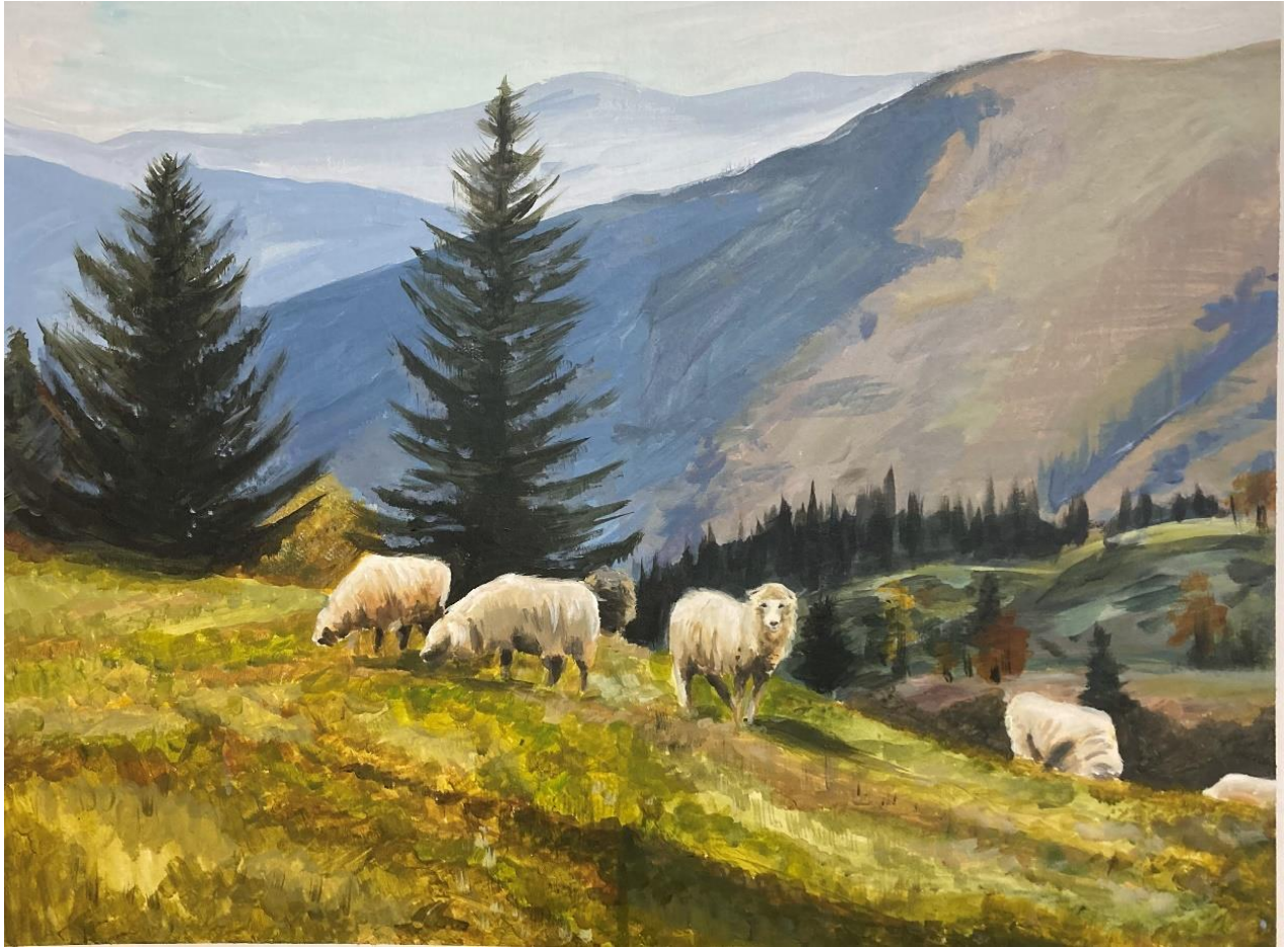
Alayna Long Nature Undisturbed Painting NFS

A tranquil mountainscape, devoid of planes, boats, and people, just sheep being sheep surrounded by God's creation. I started this painting with the full intention to depict nature in its most purest form, and while it still depicts that to me it also communicates a lot on life itself. Life and connecting with other people lives in the modern day have been increasingly getting more complex when it truly shouldn't. Sheep together grazing on the mountain and enjoying such simple parts of their life like eating together to form a bond. And while in modern life these occurrences of sharing peaceful moments such as eating meals together, or even just relaxing together can easily be overlooked when there's so much to do in life. However when a loved one's life cycle has ended it's often times these moments of making each other laugh over simple things that will be remembered of you loved ones when you can no longer create any more memories together. And remembering these moments of those who you have loved can also evoke peace and tranquility in your life, just as God's creations do in this painting.