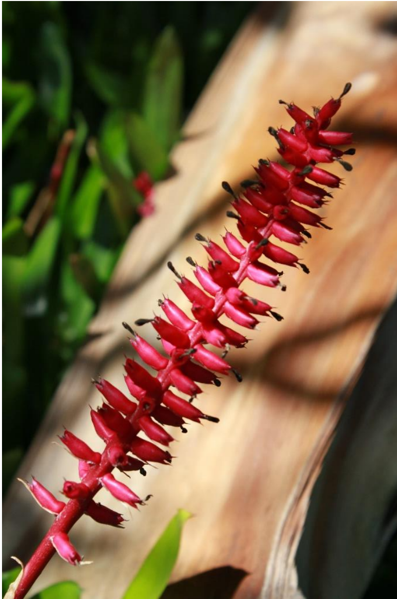
Mia Clair Blooms of Spring Photography $200

When I found this beautiful flower in Memorial Park in Downtown Stuart, I knew I had to take a photo because the lighting was just right. Through this photo, I wanted to capture the natural beauty of Florida's flowers and also add contrast with the bright pink flower and the green leaves, creating the idea that this flower is a hidden gem amongst ordinary plants. I edited the photo to bring out the vibrancy of the plants so that I could better show this concept. This photo inspired me to create more nature photographs to show how beautiful something so simple can be.