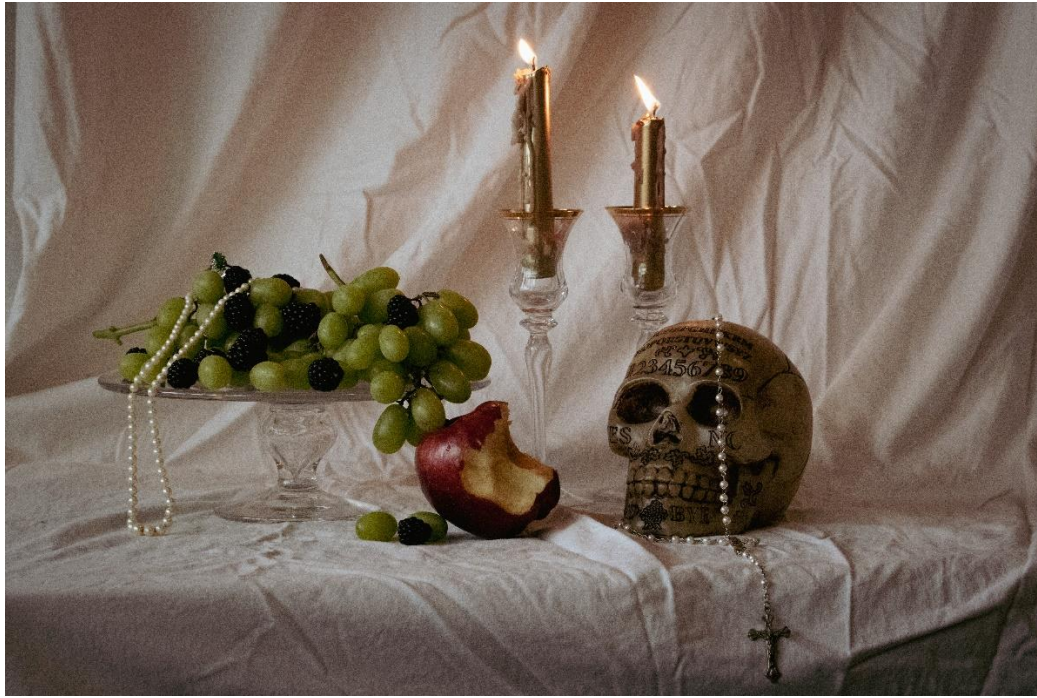
Chloe Tolton Memento Mori Photography $300