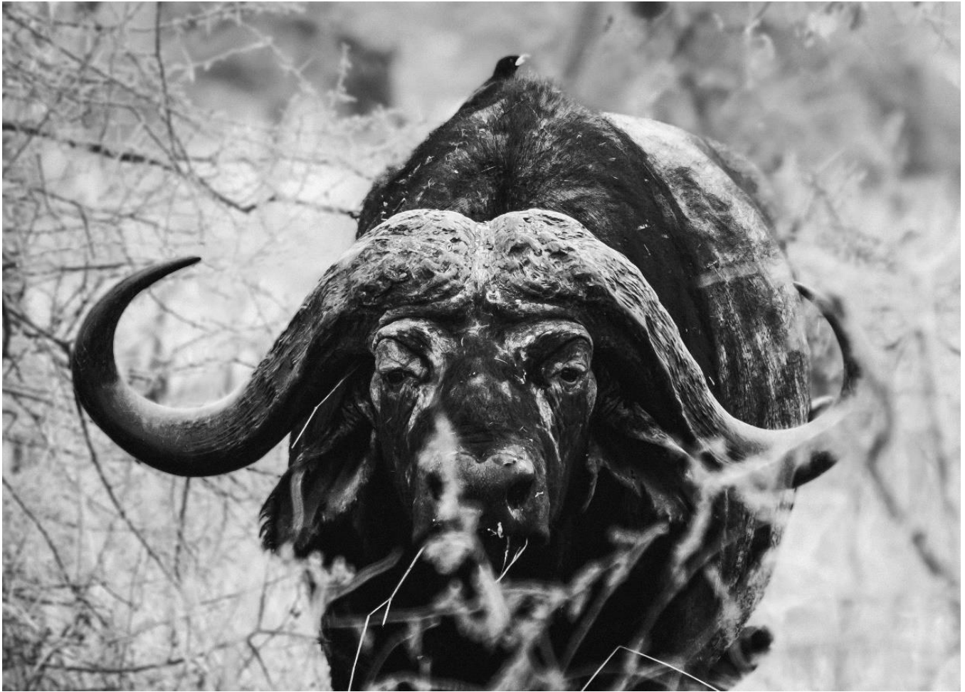
Jaime Lopes Statue of the Wild Photography $350

As a kid, I loved the great outdoors, specifically wild animals. Now through my photography, I use my love for the environment to showcase the beauty and intricacies of the natural world. I recently had the opportunity to go on a Safari tour in the Serengeti. I used black and white to highlight the contrast between the water buffalo and its environment. The branches also form a natural frame around the buffalo, focusing the viewer's attention. I use photography to frame the world how I see it, sharing my appreciation for the life around me.