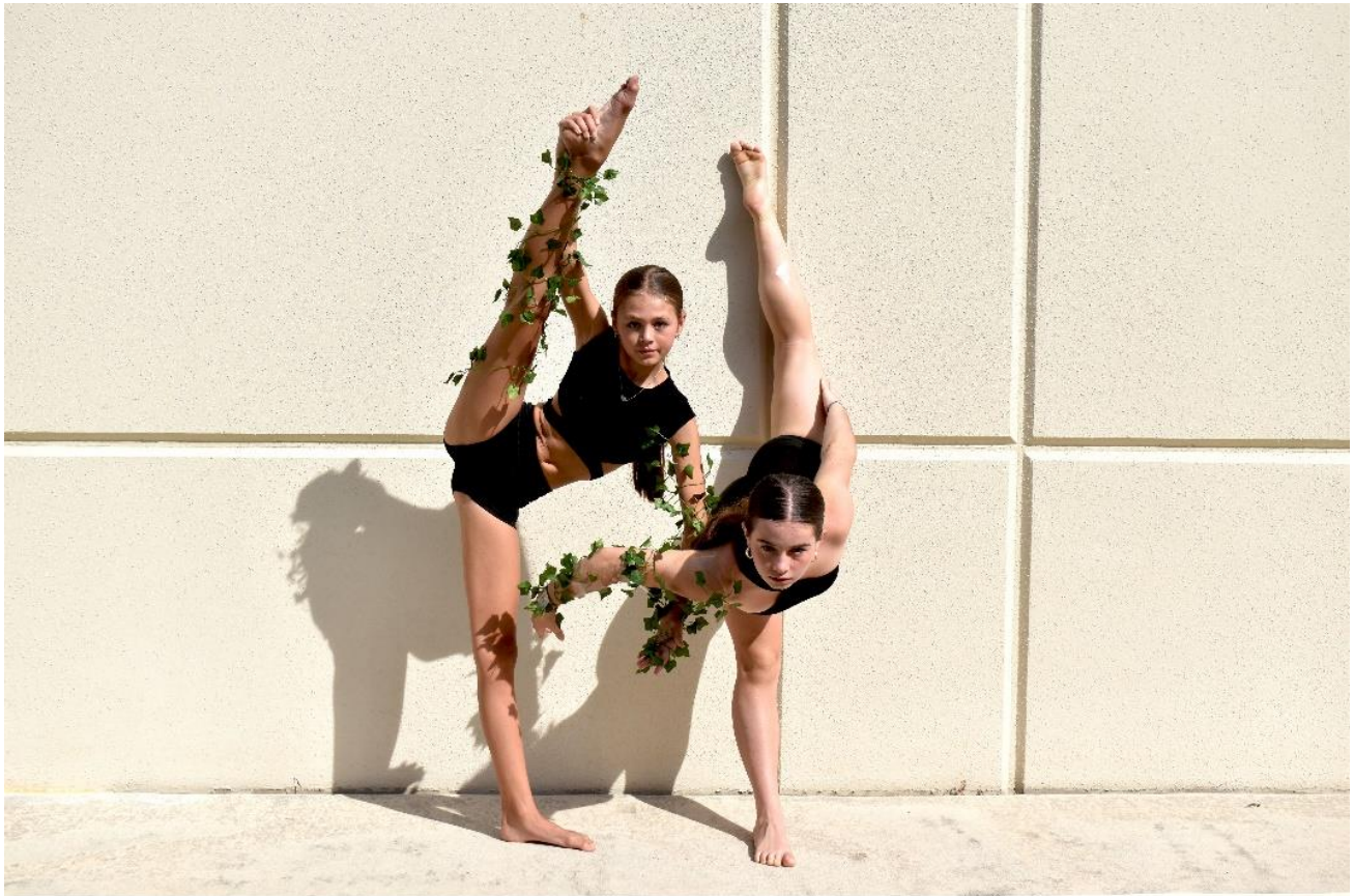
Taylor Hall Mother Nature Photography $285

Today's society constantly undervalues women. Although women are beautiful creatures, is this the only thing society sees us fit for? Mother Nature is a widespread stereotype that portrays women as delicately, beautiful blossoms that nurture the earth and the people within it. Through this photograph I want to dispel the common misconception that women can't be graceful and assertive. Women that possess intelligence can't also be gorgeous? Women that strive for something on their own are simply too much? Women are courageous, resilient, invincible, and fierce. Let us approach Mother Nature in that manner going forward.