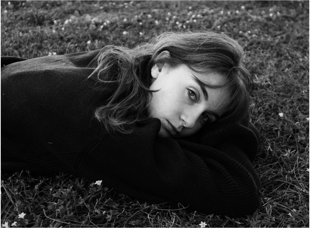
Kennedy G. Little Flowers Little Thoughts Photography $200

Beauty can be found in some of the simplest places, you just have to look. For example, to some people flowers are just flowers nothing more nothing less. But to others, flowers are poems folded into something intricate and beautiful. The piece I have created is about all the little details that can be discovered in black and white photos. With just a simple glance of my photo, you will see a 15-year-old girl laying on her stomach looking straight at the camera. However, if you take a closer look to analyze the photo you will discover so much more. You can find the details in her hair, skin, eyes, eye lashes, eyebrows, lips, sweater, and even the grass, flowers, and even the pine needles. Even with all the little details that would seem to crowd the focus of my photo, the different shades of gray, white, and black make my model, and friend, stand out among the grass and flowers.