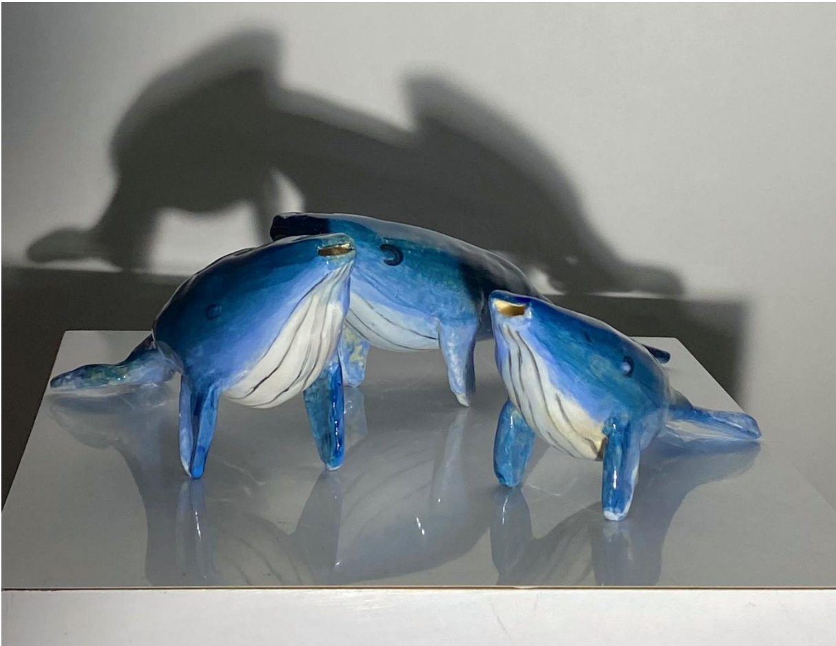
Daphne Dalton Whale Song Sculpture NFS

Known unofficially as the aliens of Earth, octopi are exceptional creatures. They can change every aspect of themselves; color, shape, and size. In the blink of an eye, you may just see a whole different animal. Not only do these abilities act as protection for the creatures, but they also allow for communication. Using color and body shape, octopi are known to express their emotions. This nonverbal language acts as a connection between them and the rest of the world. This lenticular painting will change before your eyes, representing the physical communication used by Octopi.