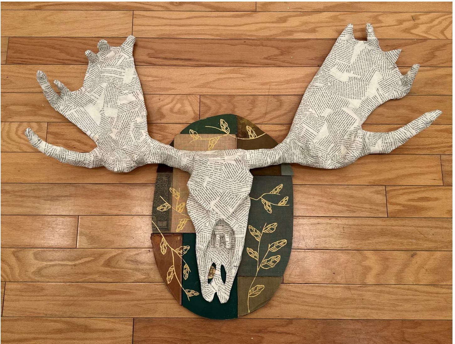
Parker Shore Books and Bucks Sculpture $150

Wire, cardboard, paper mâché, hot glue, book covers and pages. I made this piece because I loved the idea of making a life-sized moose head that could be hung up like a taxidermied one. Here in Florida hunting is very popular and taxidermy animals are common decor. I used book covers as the mount to tie together the book pages used for the rest of the paper mâché. To create the skeleton I formed wire into the shape of antlers and then filled it with magazine to give it shape. The skull is built of cardboard and then as a whole, it is covered in book page paper mâché. I like using paper mâché because it is the most versatile. Although sculpture isn't my favorite art form, I have grown to love it more as I learn better techniques.