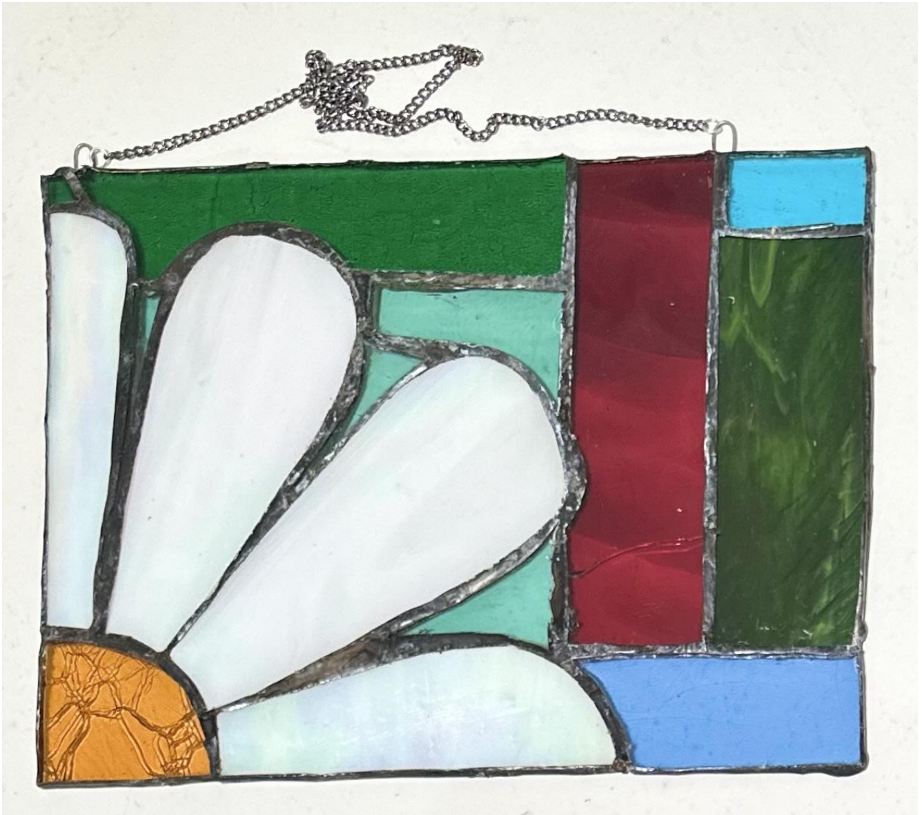
Olivia Tingley Let The Light In Sculpture $125

This piece was created using the process of stained glass. Stained glass traces back to 17th century Britain and has been enjoyed by people since. I particularly enjoy the way the colors look as the sun shines through the colored glass and it creates an array of light beautiful to the eye