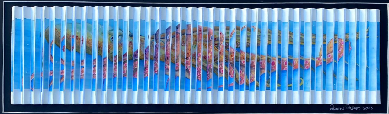
Daphne Dalton Shapeshifter Painting NFS

The largest creatures on earth can be some of the most docile animals on the planet. Whales travel the world together in pods searching for food and mates. Whales travel and communicate with one another across the span of the ocean through song. Their communication is music, and therefore creating a musical instrument is the most effective way to display their mode of communication. Each glazed ceramic Ocarina makes a sound when blown into the mouth.