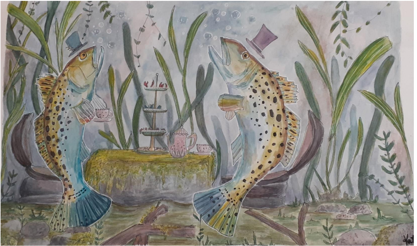
Katelyn Khin 2 For Tea Painting $250

I normally don't paint or draw animals, much less fish but for this assignment I was assigned salmon or sea trout. At first, I wasn't sure what I wanted to do but the idea just popped into my head; two fish having tea with a side of dishes that includes crabs, small fish and other small delicacies. I tried out a few other ideas but I couldn't come up with anything that I liked better than this. I used lots of bright colors to portray a feeling of fun and silliness because its fish having tea with top hats. This piece taught me to just have fun and let my creativity flow wherever it wants go.