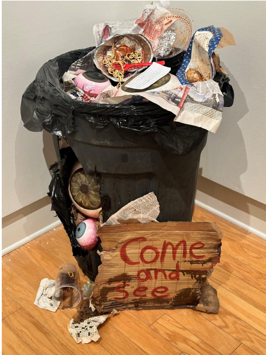
Julia Argraves Come and See Sculpture NFS

I used Styrofoam balls for the eyes covered in a layer of paper mâché and paint, then I used stabilized gelatin to gloss them. I repurposed my old trash can as the holder for it all, I sculpted the fake food out of polymer clay and resin, using paper plates and tin foil too. My intention with this piece was to express how I feel powerless and guilty about my inability to help when I'm aware of waste and poverty. Purchased items: Polymer clay, Styrofoam balls, trash can, paper plate, plastic fork, plastic cup.