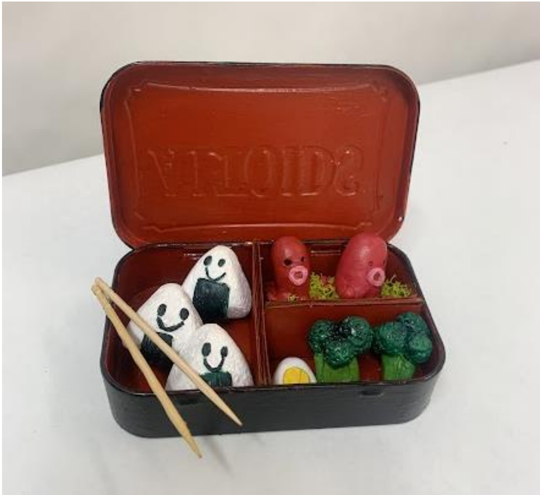
Jemima Sejour Mini Bento Box Sculpture $100

My piece represents a creation of things I love in miniature form. I chose to make a miniature bento box because of my love of Japanese culture and small foods. I specifically chose to create onigiri, which are Japanese rice balls and sausage octopi along with some broccoli. I combined my love for both things and created something that represents me.