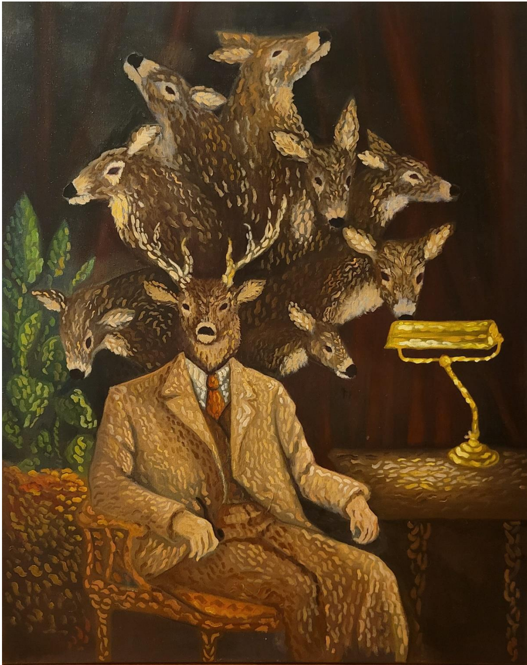
Julia Argraves Sir Bucksworth Painting $400

I used the composition of a traditional portrait with the juxtaposition of a surreal and unusual subject. The imagery of a suit, velvet curtains, and dark wood is meant to show the wealth of the subject, the multi headed deer is meant to confuse or unsettle, like a dream. The defined short brush strokes make the figure and objects stand out in the foreground and create a more whimsical appearance to emphasize the strangeness of the character.